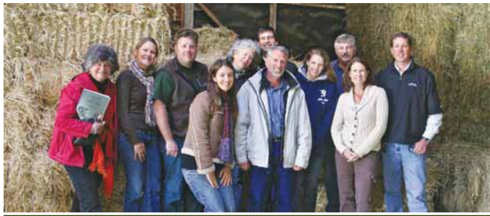
Marin Ag Summit Focus Group with farmers, ranchers, producers and ag advisors.

With new direct marketing channels, farm families have new ways to make their businesses work.